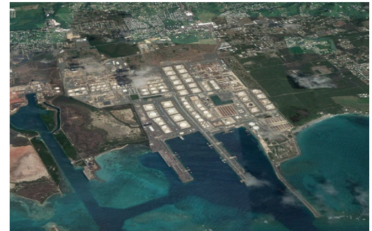
HOVENSA Environmental Response Trust,