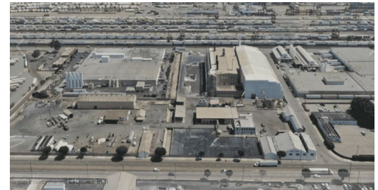
Vernon Environmental Response Trust