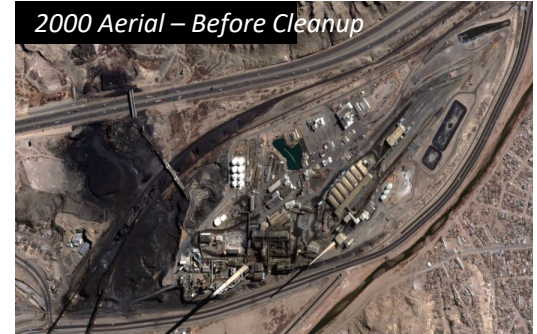
Texas Custodial Trust

Custodial Trustee since 2016 for the former HOVENSA refinery, once the world's largest petroleum refinery. Administers a $66M budget for RCRA closure, hazardous waste decommissioning, and site stabilization in coordination with VIDPNR and EPA.