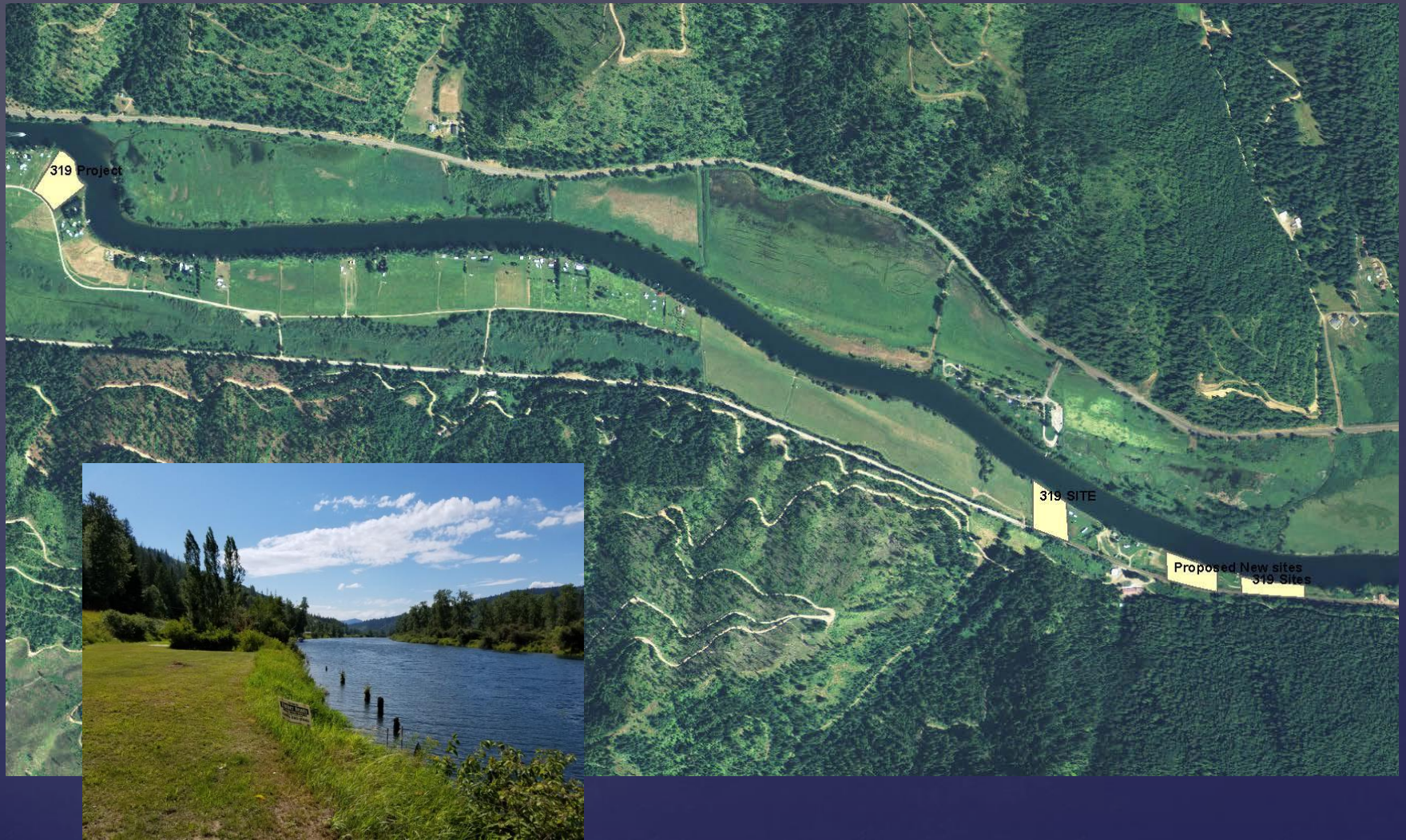
St. Joe River