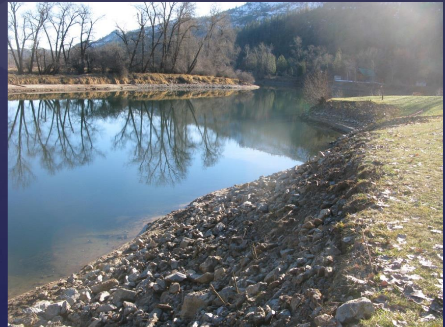
St. Joe River