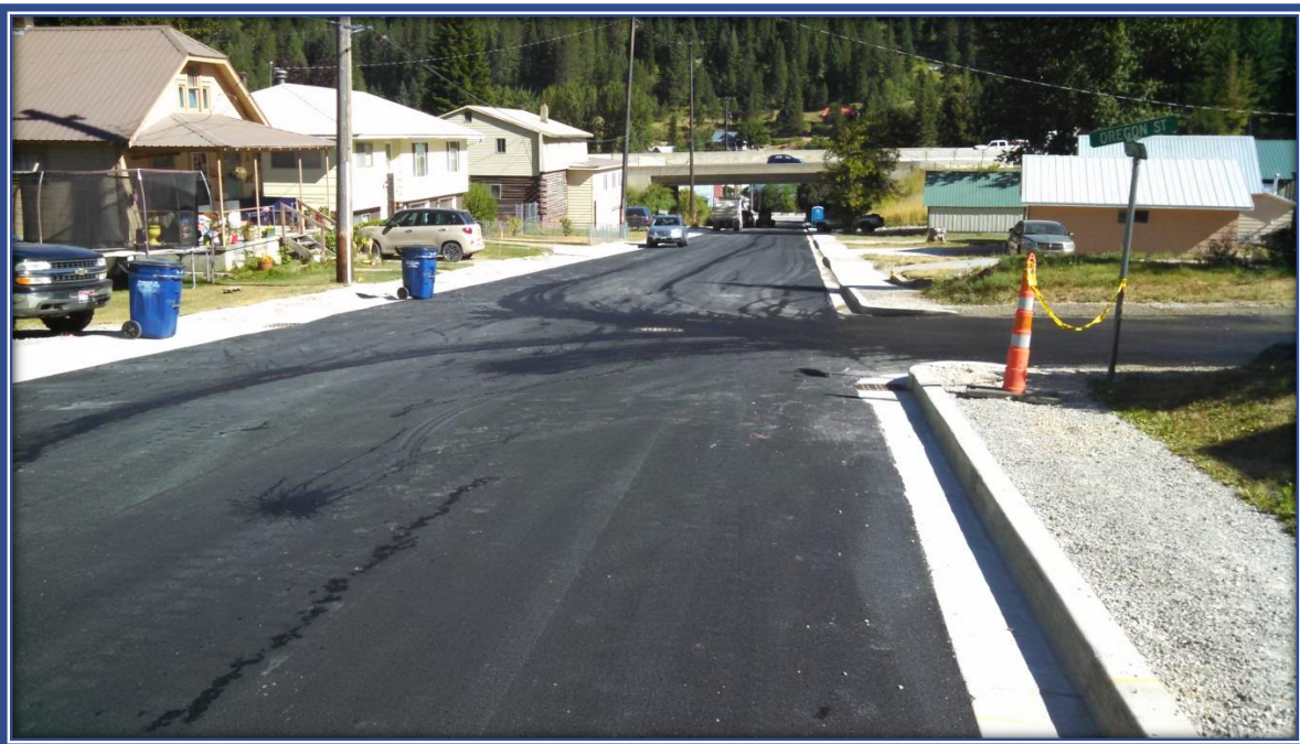
Completed Copper Street Storm Drainage and Paving