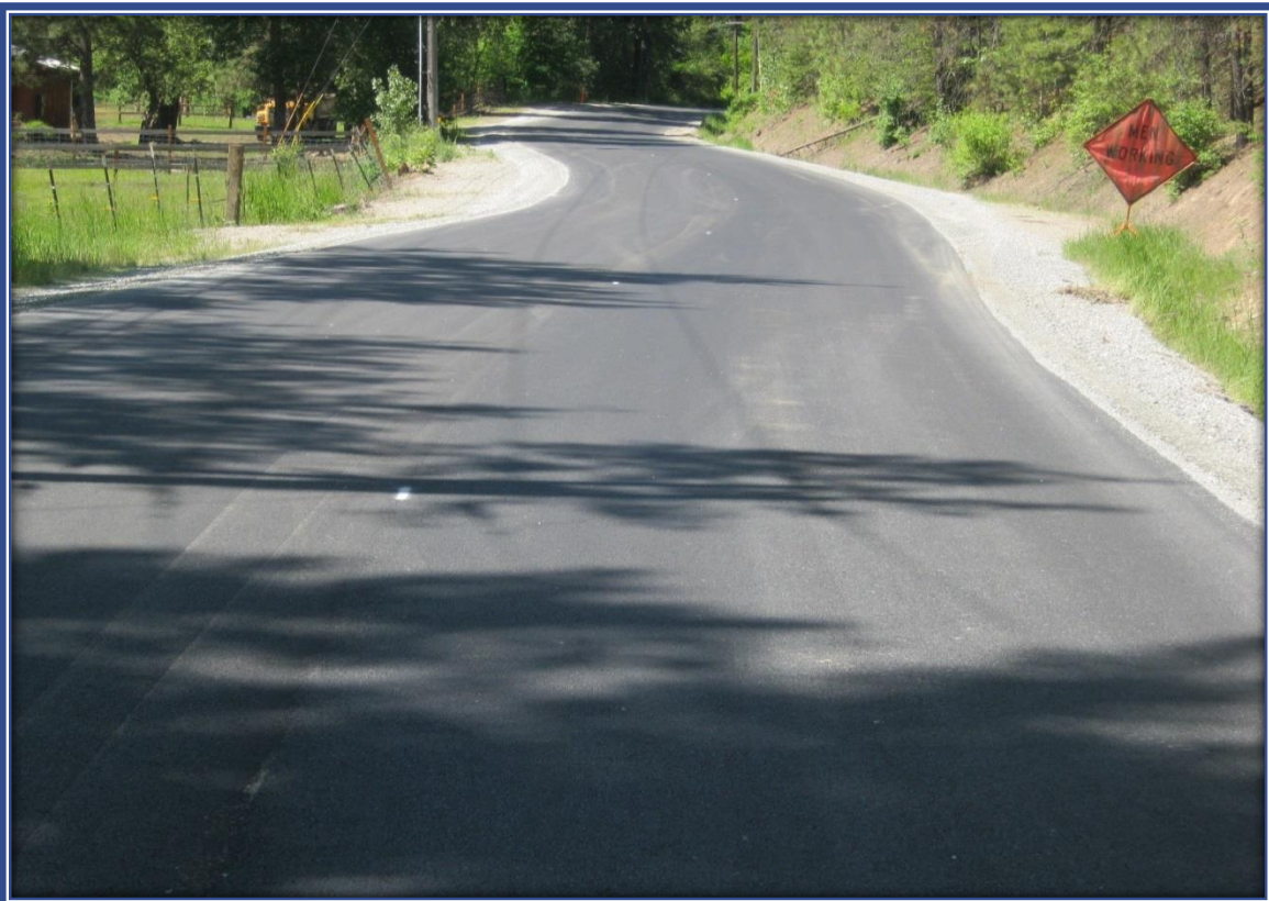
Completed Lower Page Road, Shoshone County