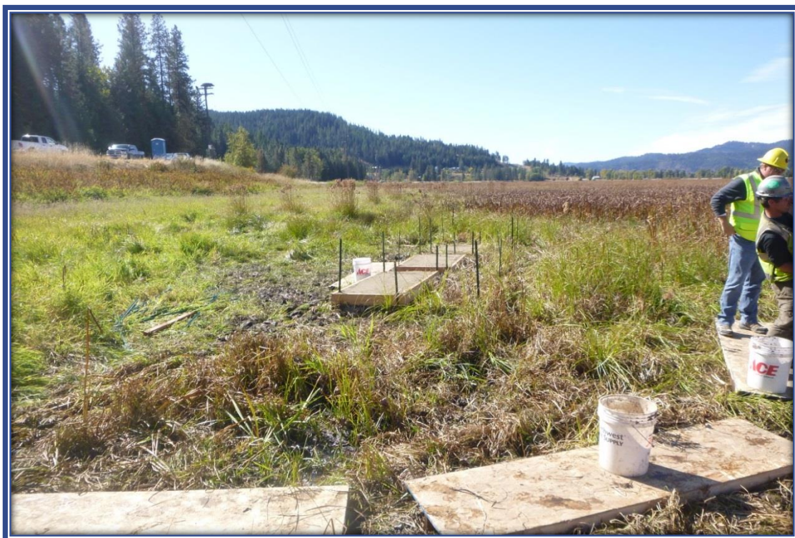
West Lane Marsh Test Plot