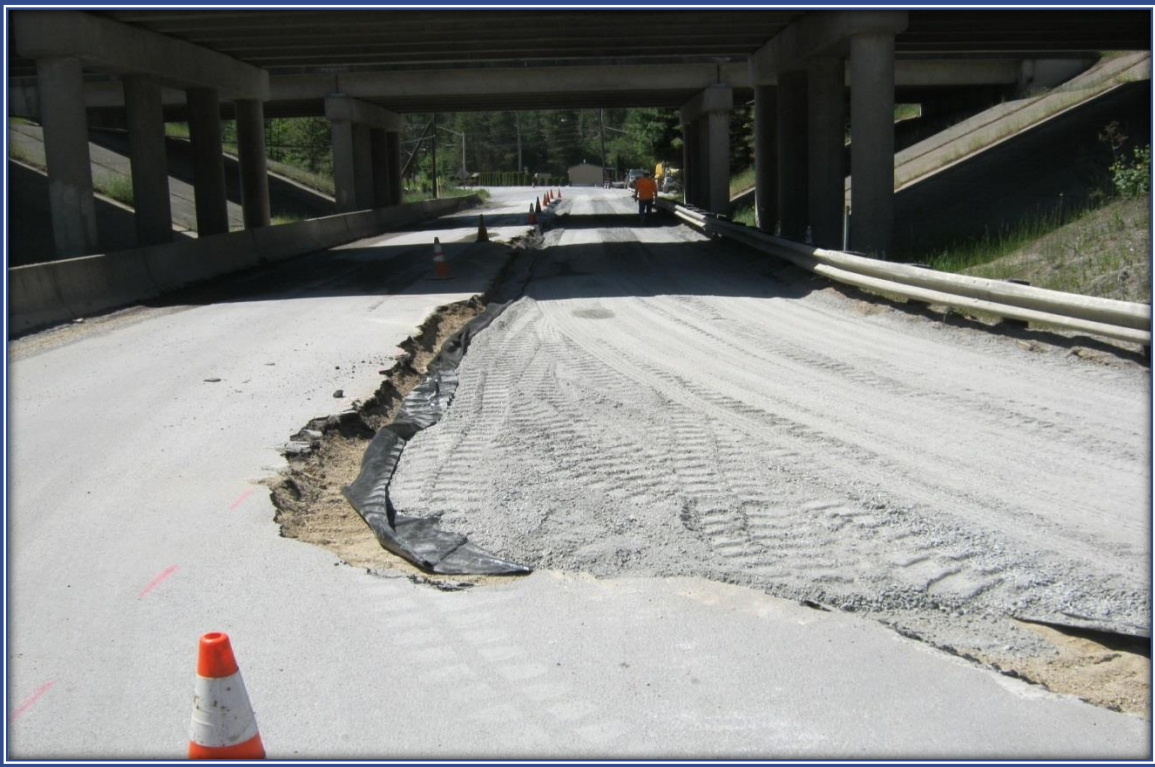
Typical Removal of Existing Pavement and Base Preparation, Osburn