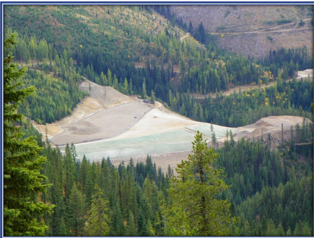
Waste Consolidation Area in East Fork 9 Mile Canyon