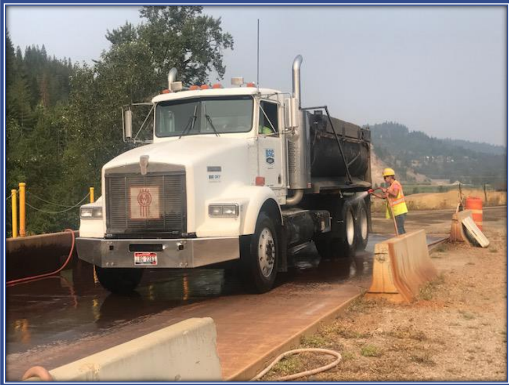
Typical Truck Decontamination After Dumping at Repositories