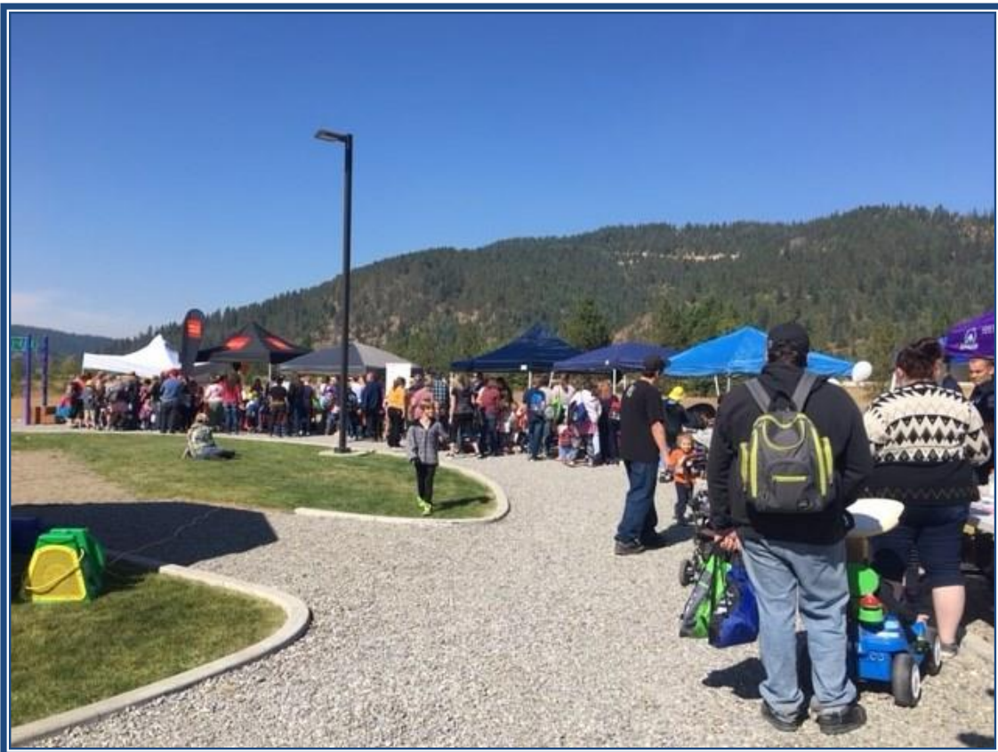
Shoshone Medical Center Children's Health Fair