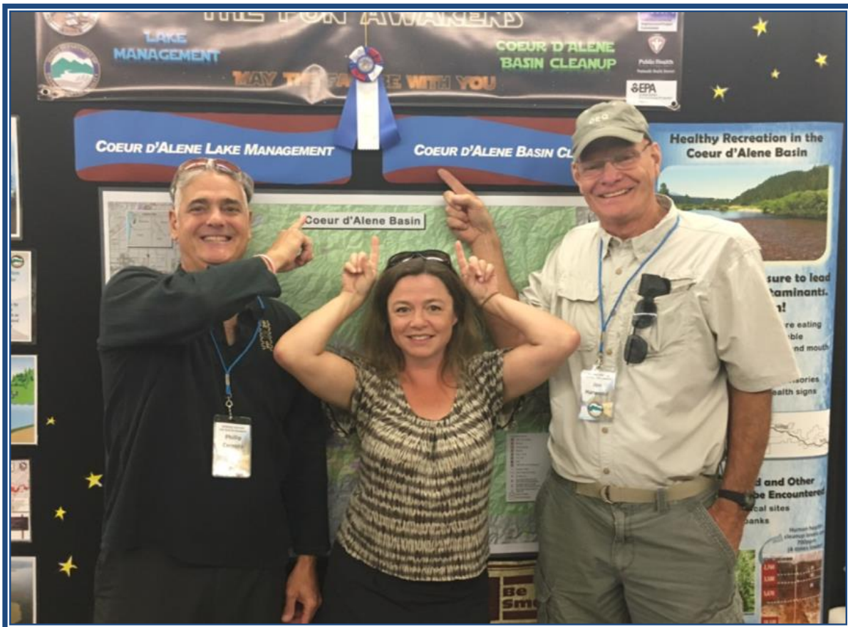
North Idaho Joint Fair Booth Blue Ribbon Award