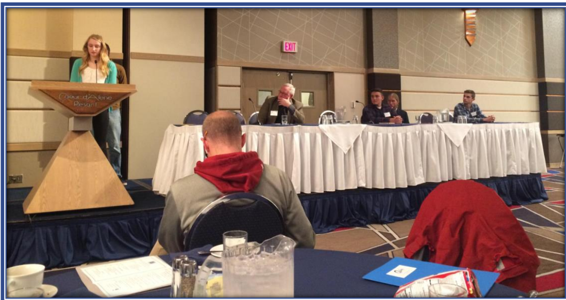
Our Gem Lake Symposium

This continued level of coordination with BEIPC forums maximizes opportunities for information exchange and advice, while recognizing that IDEQ and the CDA Tribe retain their respective decision-making authorities.