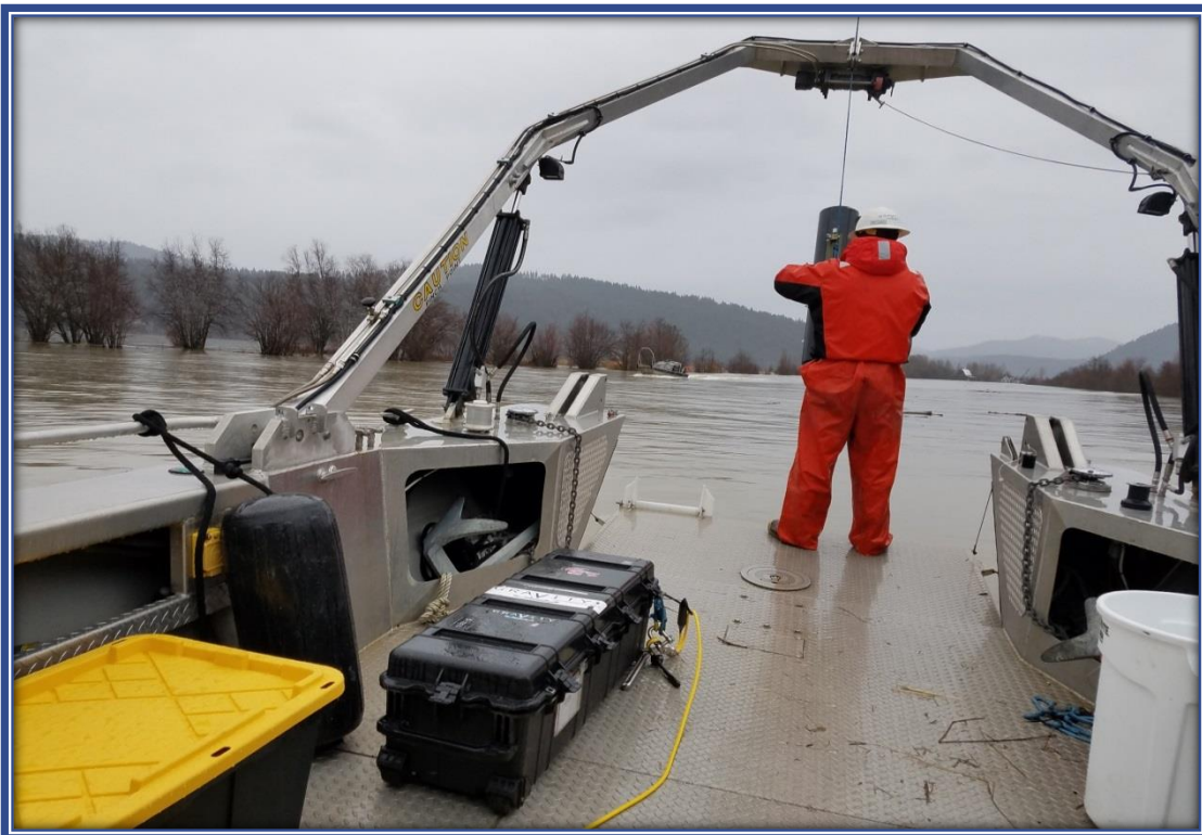
High Flow Boat Based Sampling, Lower Basin