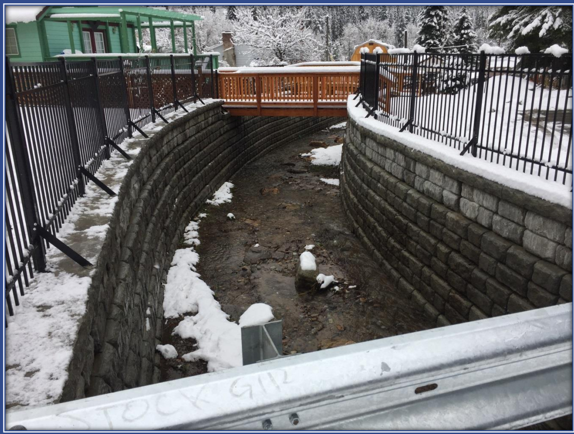
Completed Mill Creek Remedy Protection Project in Mullan