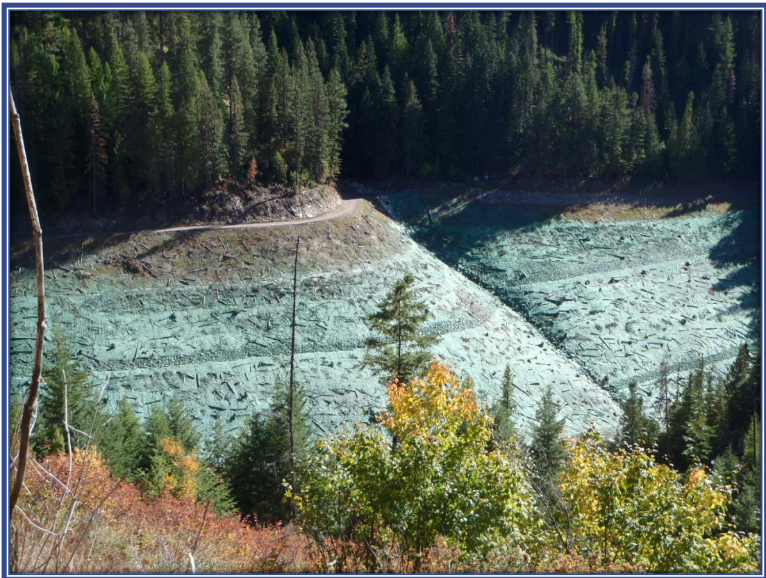
Remediated Success Mine Complex Dump