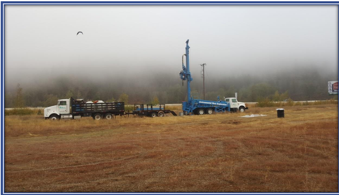
Drill Rig Working on Ground Water Collection Project at the CIA

The design includes an approximate 8,000-linear feet cutoff wall between the CIA and Interstate 90 (I-90), a series of extraction wells, and a conveyance pipeline to the CTP that extends along the north side and over the top of the CIA. Groundwater flow and strength (concentration of metals) predicted by the mathematical model represents the range from base flow/strength through maximum flow/strength. Base flow/strength typically occurs in late summer or early fall and maximum flow/strength typically occurs during spring runoff. By considering seasonal and annual variability and groundwater monitoring well data from south of I-90, the estimated dissolved zinc loading to the gaining reach of the SFCDA River ranges from 150 to 450 pounds per day (lbs/day). A significant unknown is the potential source of metals in tailings under and north of I-90 that will not be captured by the groundwater collection system. However, the optimistic target is to capture up to 90% of the predicted load to this gaining reach from south of I-90.