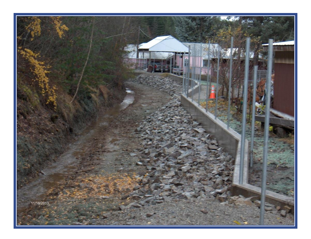
Grouse Creek Remedy Protection Project