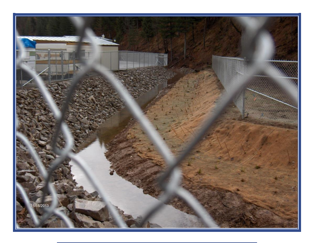
Grouse Creek Remedy Protection Project

EPA and IDEQ continued analysis of data to define the remedy protection projects for the side drainage program noted in the RODA. Completion of the analysis process and preparation of an Explanation of Significant Differences (ESD) or other decision document is now projected to be completed in 2014, so that those projects can be incorporated into out-year programs of work.