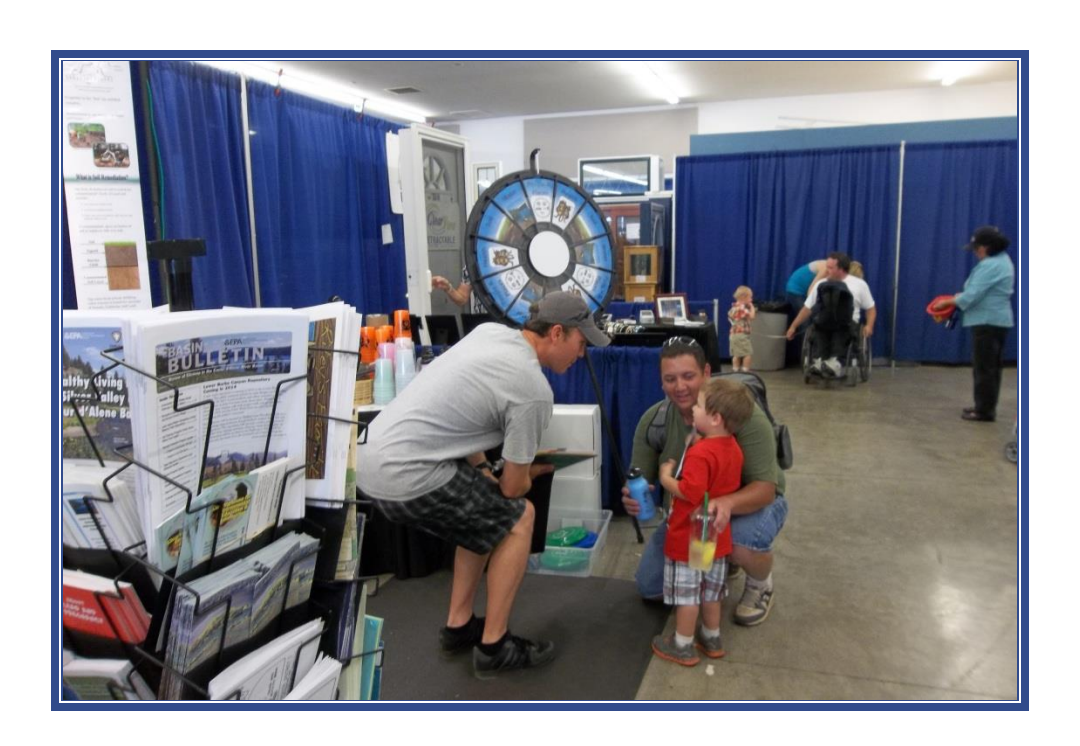
North Idaho Fair Booth