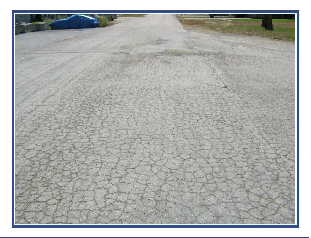
Damaged Paved Road Prior to Remediation \mathbf{1^{st}} Street Pinehurst