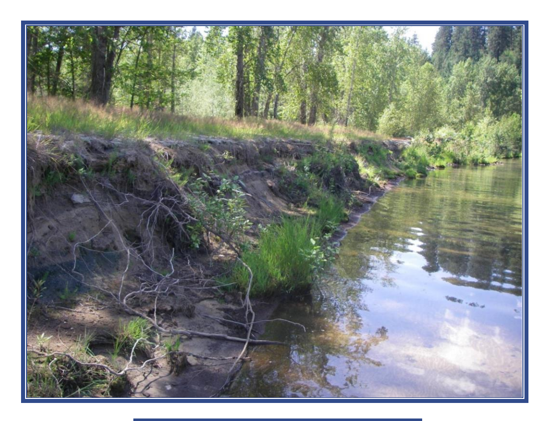
Summer 2012 Looking Downstream

The USFS Recreation staff worked through designs and identified funding opportunities and in 2013, the USFS paved the access road and parking area, rehabilitated the boat launch, and installed a new restroom. In January of 2013, approximately 450 feet of riverbank was stabilized utilizing encapsulated soil lifts with coir fabric. This bioengineering technique did not require the use of any hard rock rip-rap. In February, USFS staff along with other stakeholders installed vegetative plantings along the riverbank.