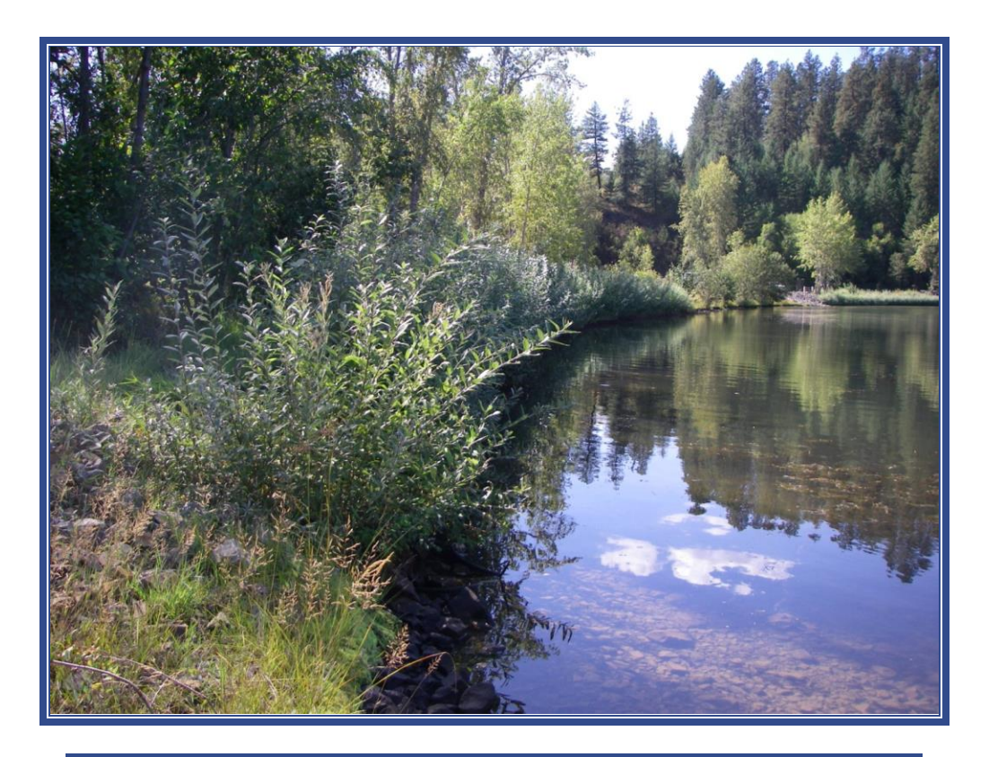
October 2013 Project Complete From the Same Photo Point

In 2012, IDEQ characterized contaminants at Gene Day Pond in Osburn to investigate community-generated ideas about rehabilitating the pond for recreational use. Additionally, the Trust funded historical research. In 2013, IDEQ and EPA concluded that the soil did not exceed human health contamination thresholds, would not require remedial action, and would not be eligible for additional superfund cleanup funds. The community may choose to continue the project with other support agencies such as the Idaho Fish and Game and funding options that support recreational development.