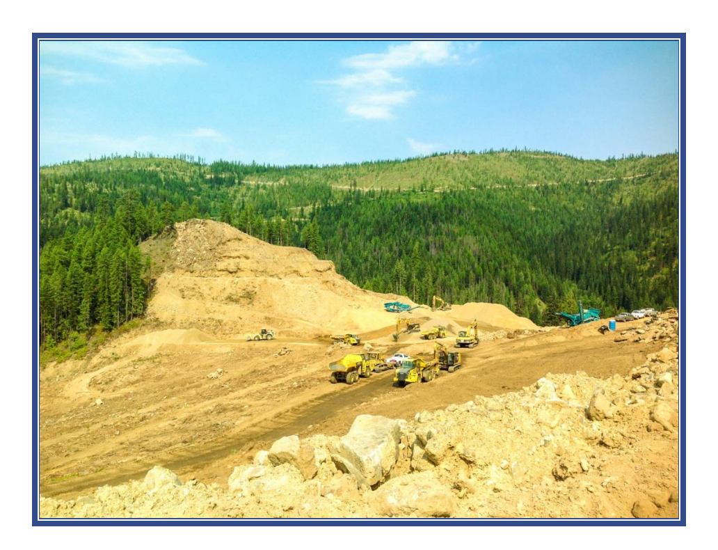
EFNM WCA Construction Operations