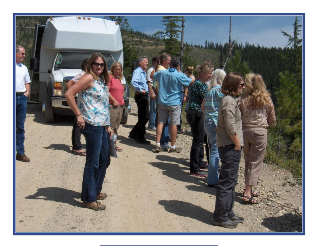
BEIPC August Field Trip