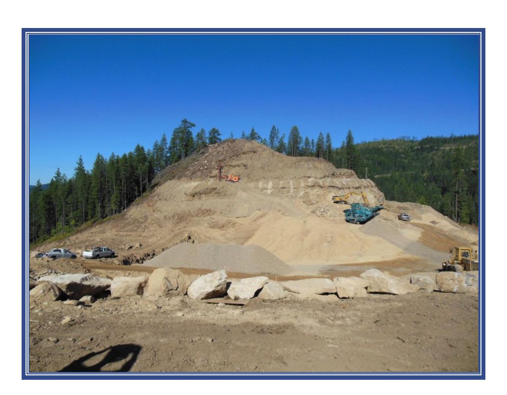
EFNM Crushing Operations