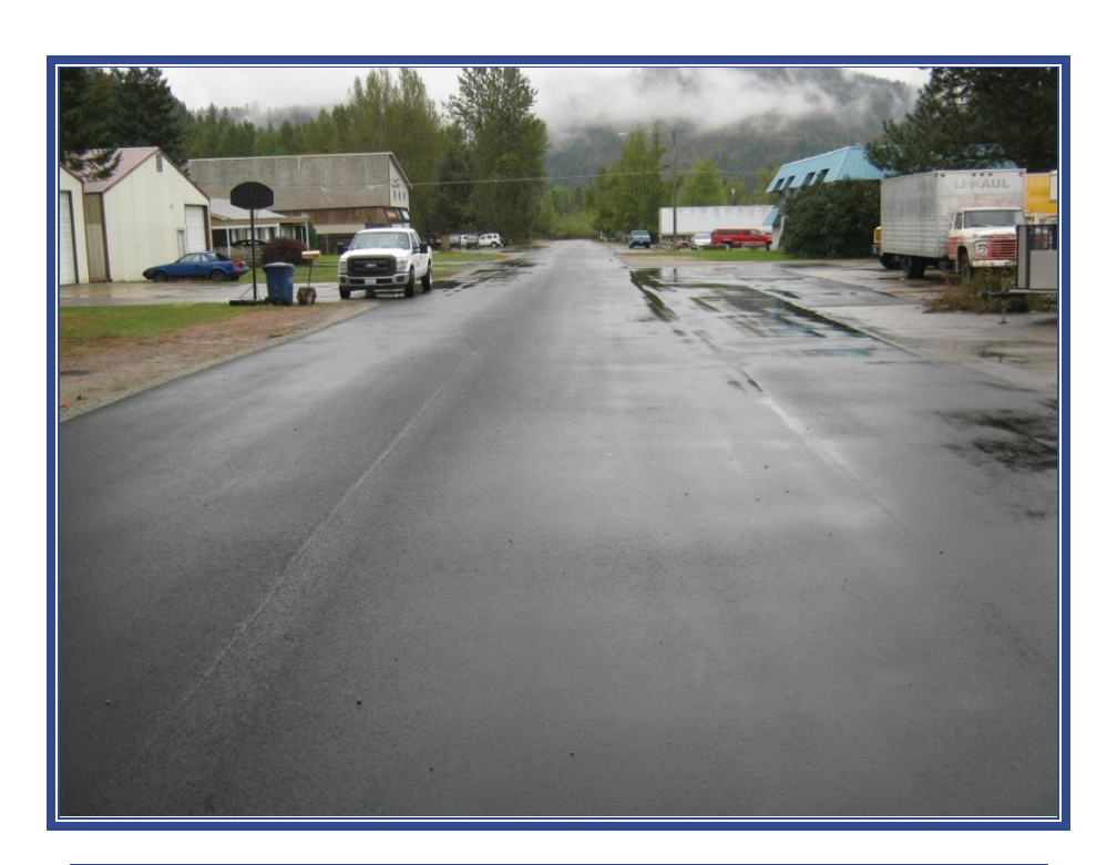
Paved Road Remediation Complete 1st Street Pinehurst